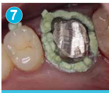
Expasyl™ paste in action