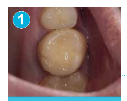
Crown for a patient complaining from aesthetic, food impaction and bad odor when he flosses. He wants to replace it.