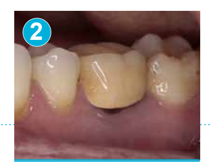
Discolored exposed margin and plaque accumulation on the crown surface.