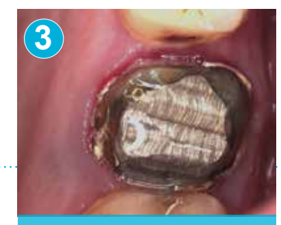
Removed crown. We can see the cement at the open margins and the inflamed gingiva due to defective margin of the crown.