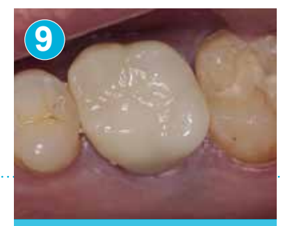
Cementation of the crown. Post operative photo directly after cementaion.