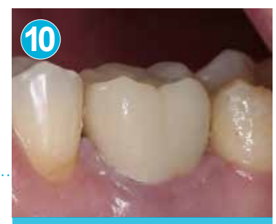
Cementation of the crown. Post operative photo directly after cementaion.