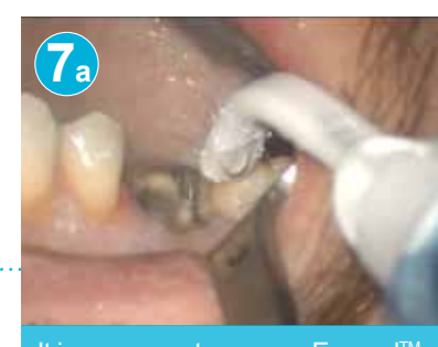
It is very easy to remove Expasyl<sup>TM</sup> Exact after gingival retraction and hemostasis was done using riskontrol disposable tip. After this step the tooth is ready to be recorded.